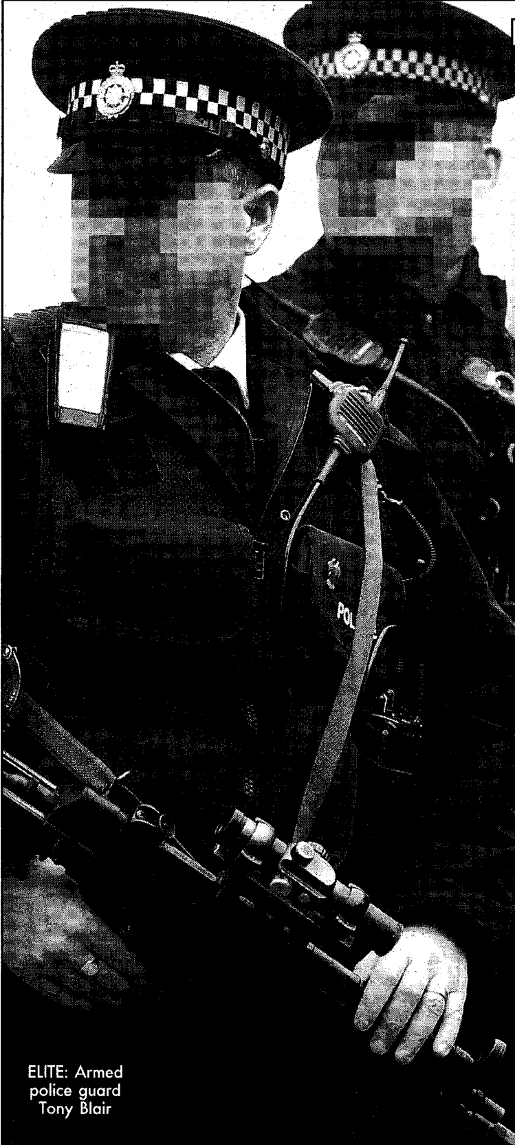
ELITE: Armed police guard Tony Blair